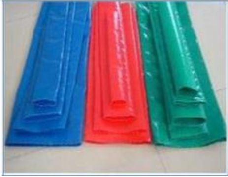
Fig.2 Lay flat of various sizes