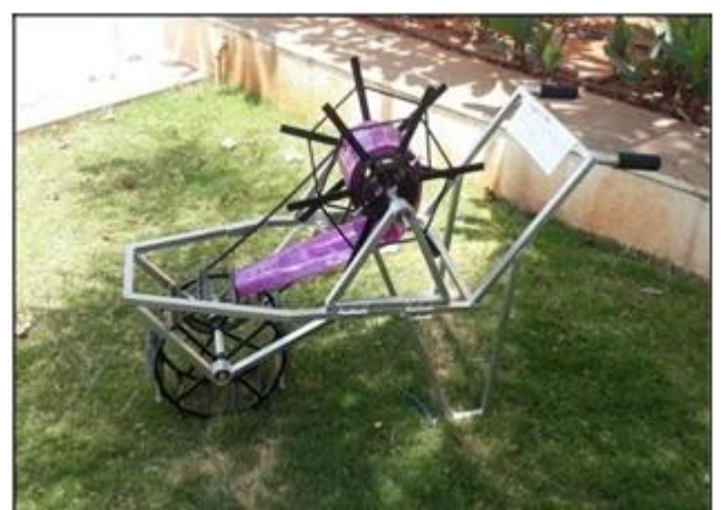
Fig.5 Actual model with reeled pipe

The design of model allows user to reel various type of pipes like agricultural lay flat pipe, Garden hose pipes. There is special arrangement has provided on reeling drum to reel various sizes of agricultural lay flat pipe. It is done by shifting movable reeling drum ring side ring to one side by unscrewing bolts. There is two modes has provided for reeling of pipe,