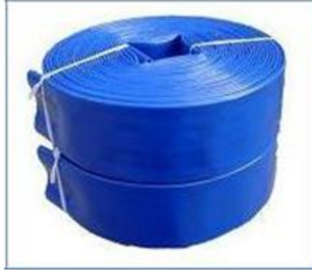
Fig.1 Lay Flat pipe

The pipes are the basic component of agricultural irrigation system. There is various type of pipe available in many pressure ratings and sizes (diameters). Rigid PVC Pipes, Polyethylene Pipes (Semi Flexible) and Lay Flat Hose (Fully Flexible) these are the types of pipes in used in agricultural irrigation system.