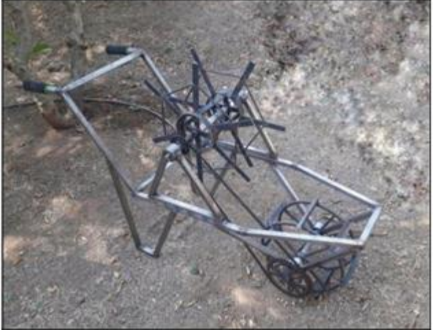
Fig.5 Fabricated Working Model